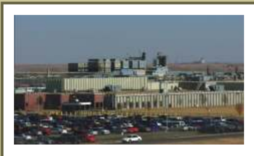
The Guymon pork processing plant opened in December 1995.

Seaboard Foods Live Production supplies animals to the Guymon, Okla., processing plant with strict control over the production process, including but not limited to genetics, nutrition and animal welfare.