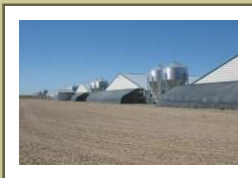
Biocurtains, the black structures, maintain air quality in and around the barns.

internal environmental database and state environmental regulations. This will improve access to and implementation of the EMS program and enhance environmental awareness in the company.